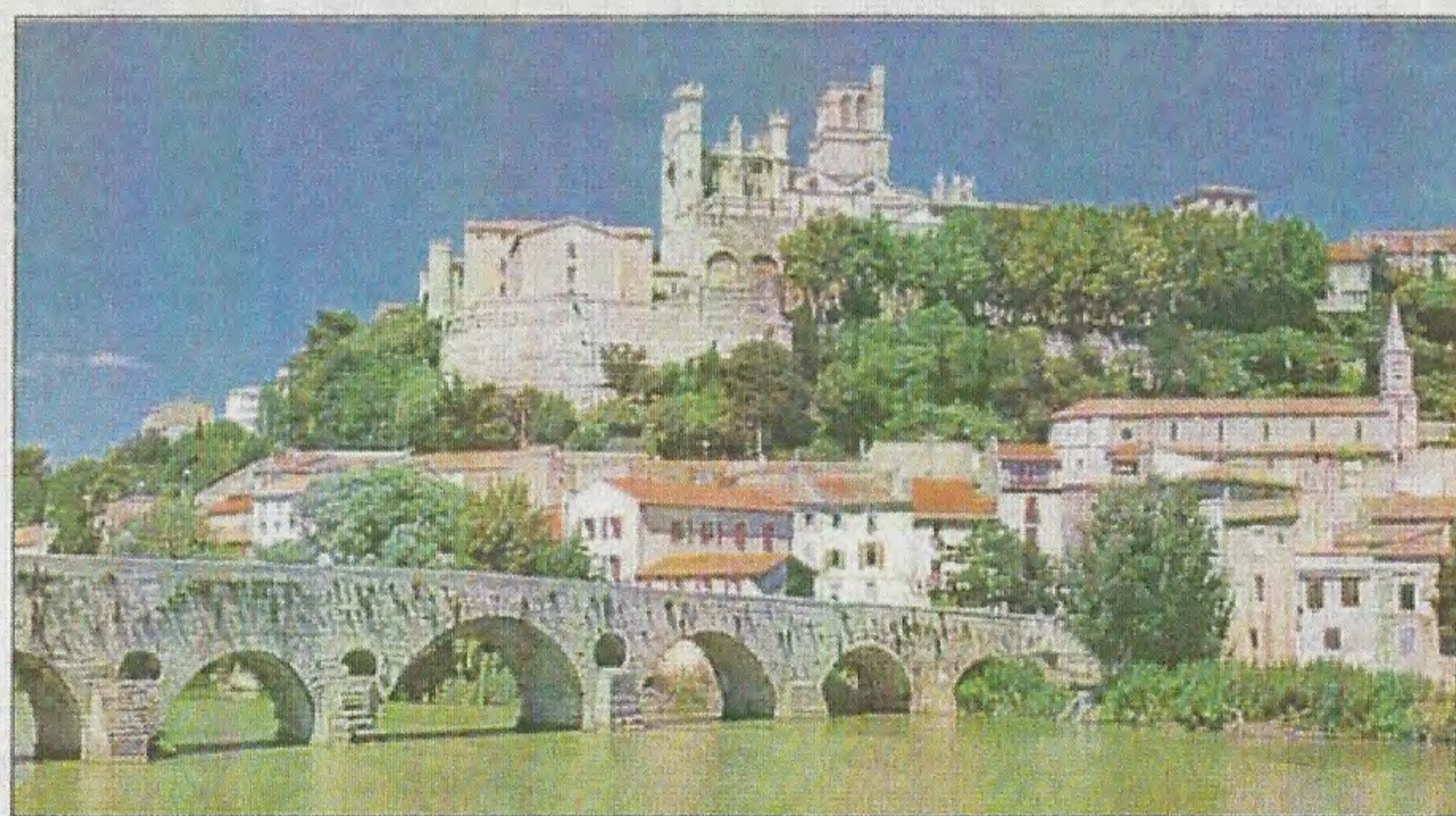
Historic Béziers in southern France is only six miles from the Mediterranean on the Canal du Midi

Closer than Cornwall, the Pas de Calais is the nearest French region to London — 55 minutes by Eurostar — with a very earthy French character and all the ingredients of rural French life without the hot sun. "Not