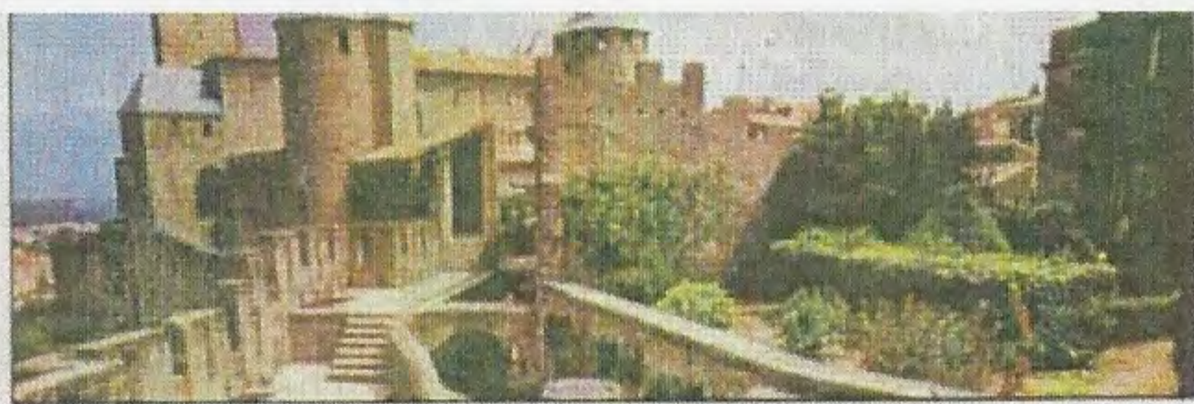
Fortified Carcassonne in south-west France is a World Heritage Site

FOR MORE PROPERTIES ABROAD, VISIT homesandproperty.co.uk/overseas